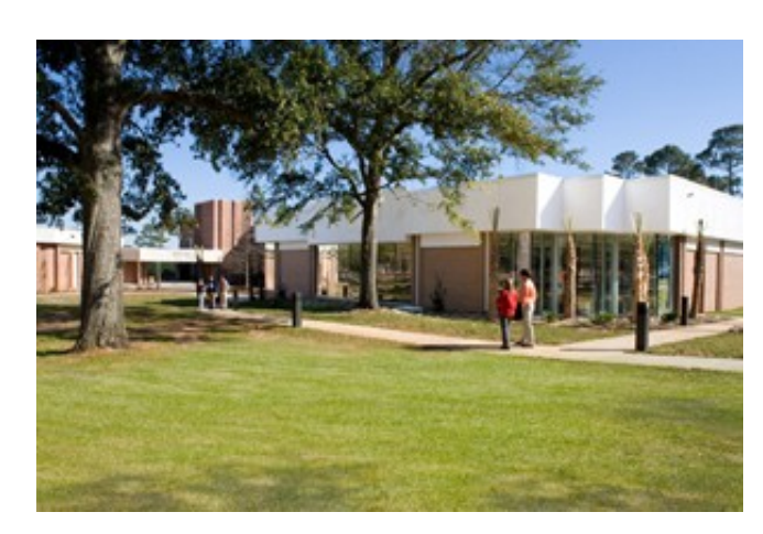
Mitchell College of Business Learning Resource Center University of South Alabama Mobile, Alabama 36688 www.mcob.usouthal.edu